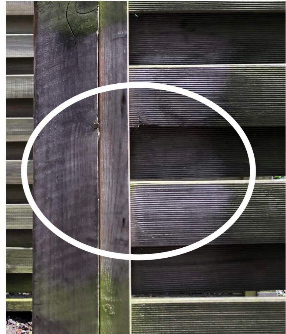
Algae has not returned 2+ years later