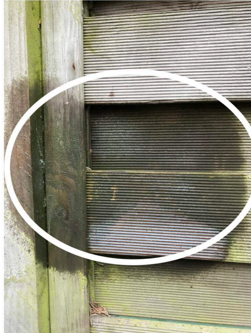
The surface is saturated and left to work