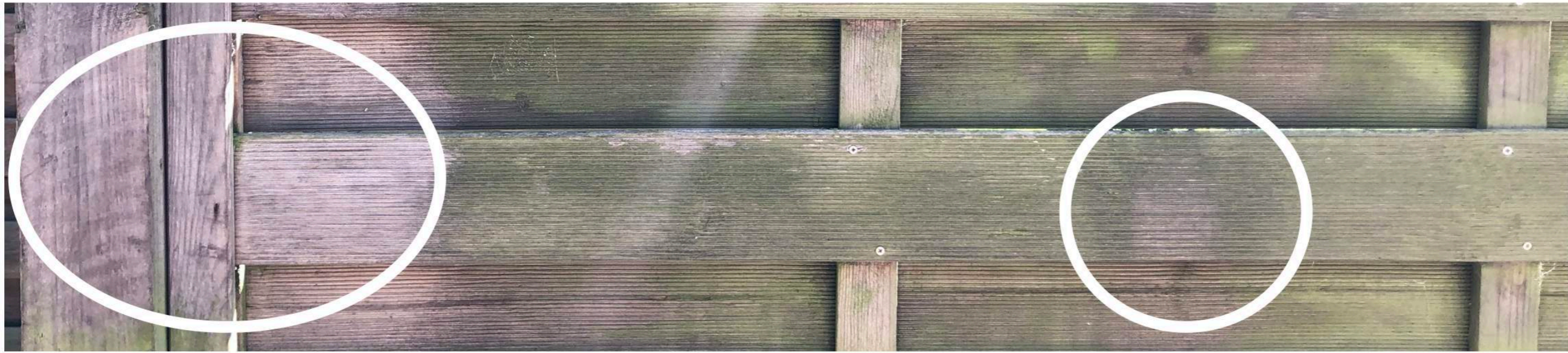
Algae Clean & Seal - continued performance 2+ years later